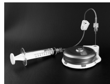
Catheter Access Aspiration Setup

Caution: Do not force the needle. Excessive force on the needle may damage the needle tip. Do not rock the needle sideways as this may damage the septum or cause infusate to leak into the pump pocket.